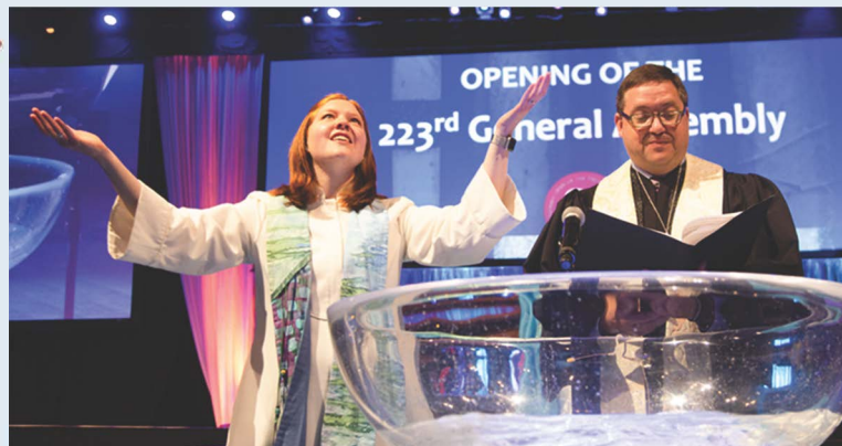
Opening worship at GA223 in St Louis, June 2018.